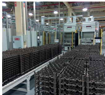
ECM (CHINA) CO. LTD. Tel.: +86 10 85802642/3 ext.101 contact.b@ecm-china.com