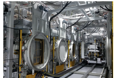
ECM FURNACE INDIA PVT. LTD. Tel.: +33 (0)4 76 49 65 60 info@ecmtech.fr