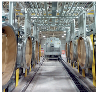
ECM USA, INC. Tel.: +1 262 605 4810 info@ecm-usa.com